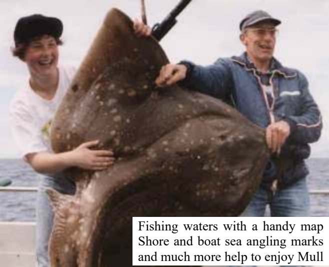
Fishing waters with a handy map Shore and boat sea angling marks and much more help to enjoy Mull